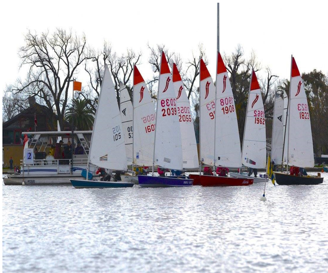
Sabres starting at the Winter Regatta