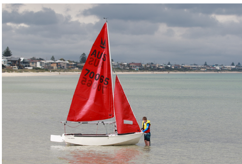
"No Chance" Rigged and ready to go (before all my crew on mass mutinied)

I got all the sailing gear organised the night before and hooked up the trailer. However as seems to be the case organising four kids in the morning proved to be a harder task; the phrase herding cats comes to mind! Well eventually we set off and also, as seems to be the pattern, arrived a little late for the coffee cruise. We rigged the boat as the other six mirrors were slowly leaving the beach in all of 1 knot of breeze.