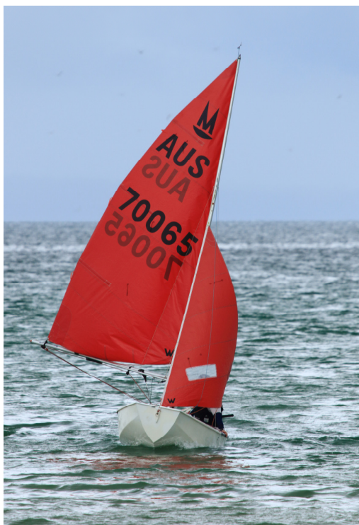
Solo Mirror Sailing, not really what I had in mind...