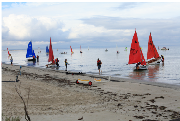
Mirrors leaving the beach for the Coffee Cruise

I had a slight altercation with a double hire kayak the week before, but managed to patch up my Mirror "No Chance" in time for the event.