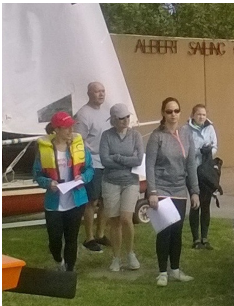
Participants in the Better Sailing program across March and early April

Sign on at 9.30am. for 10.00 am. Briefing. Details out in early April.□