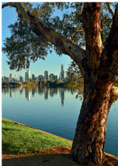
Albert Park Lake

Not far from the CBD, Albert Park Lake is a really pretty spot. It's a man-made lake surrounded by parklands and sporting facilities, and is popular with dog owners, walkers and runners. I live up the road and I like going for a run or a walk around the lake – the track is about 5km. It's great for a picnic or barbecue and the trees have lovely shade. You can learn to sail at the Albert Sailing Club, swim at Melbourne Sports and Aquatic Centre or play golf at Albert Park Golf Course – that's a lot of options in a small area.