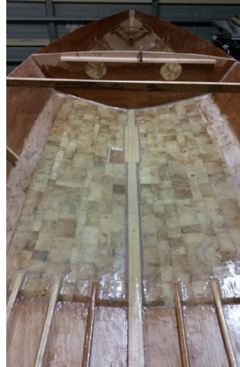
Both sheets in and fibreglassed

The Impulse is not that hard to build and can be done by any home handy person using basic tools. However power sanders, drills, saws, and planes make it that much easier again. Nowadays epoxy glue is used throughout and with the use of powder additives, also has the benefit of being able to be mixed really thick which is great for filling gaps negating the need for perfect joints. In fact the bigger the gap, the better the glue joint has been my experience!