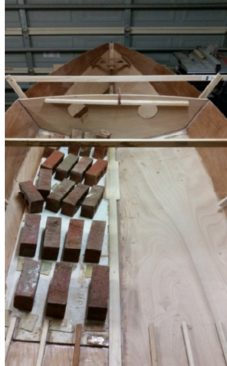
Balsa on floor while glue sets