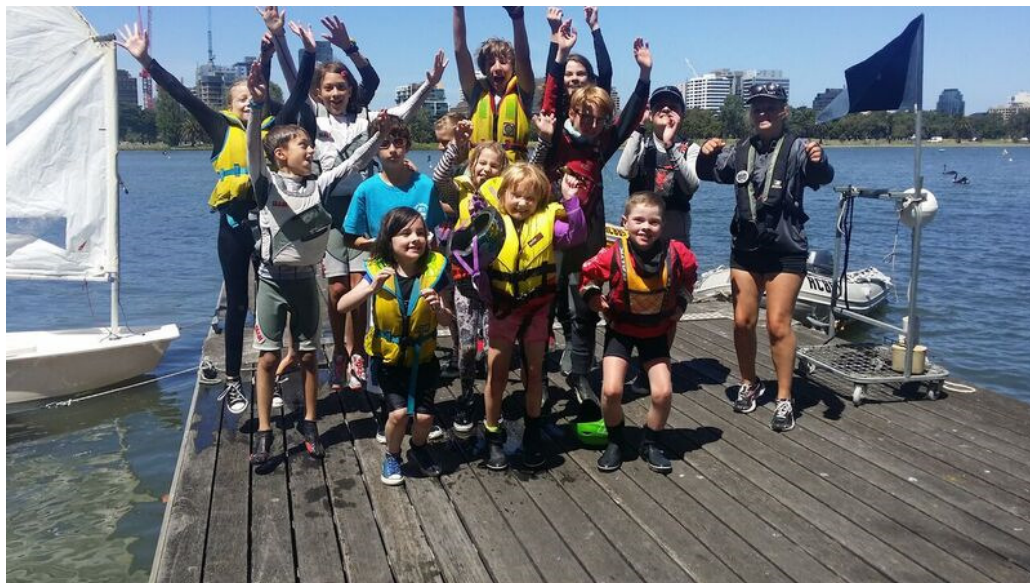
Junior sailors at the January School Holiday program

3 day program, Monday 3 to 5 April, in the first week of school holidays. Details have been forwarded to parents of ASC juniors. This is a program for juniors who have completed at least one sail training course. Instructors will be from the Albert Park Boatshed. Information and registration can be found under Upcoming Events section of https://albertsailingclub.wildapricot.org/