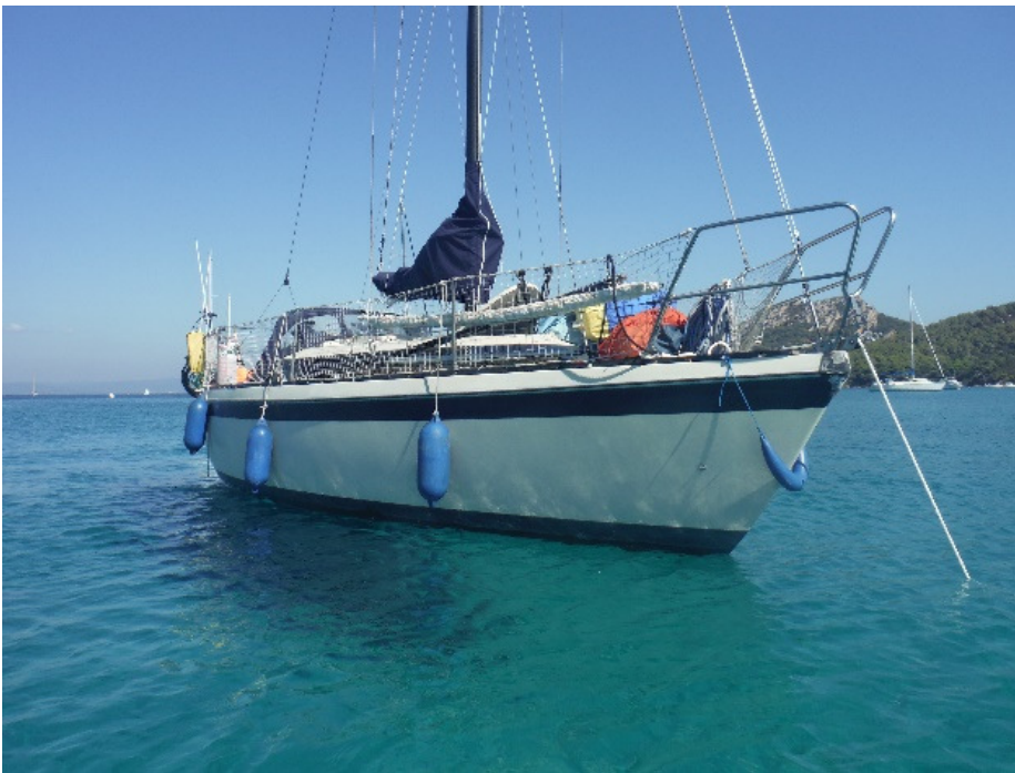
Baldr on the Med

Skip forward to 2011 and the idea of another European boating adventure re-emerged, this time though we had 4-year old Hamish and Tess was one, could we do such a journey again? The boat would have to be a bit bigger and perhaps buying one in Europe rather than England would speed the process up. From scanning the internet for boats, it became clear that the Netherlands had more boats in a smaller area than any other country in Europe, perhaps the world. We were in for a surprise, as it turns out the reason there are so many boats in the Netherlands is because it is a fantastic place to have a boat. Within 10 days of arriving in the northern province of Friesland and having looked over 18 possibilities, we knew the moment we saw Baldr this was the boat for us. She is a lovely 1981 Friendship 28, and like all Dutch yacht designs is extremely well thought out below and on deck. As we pulled away from their jetty the previous owners asked us where we were headed, we said we were not sure. Flippantly I said maybe the Med, which we ultimately reached but it took five years to get there!