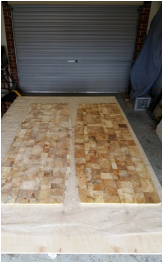
End grain balsa cut to size

Photos below show the fitting of end grain balsa sheets.