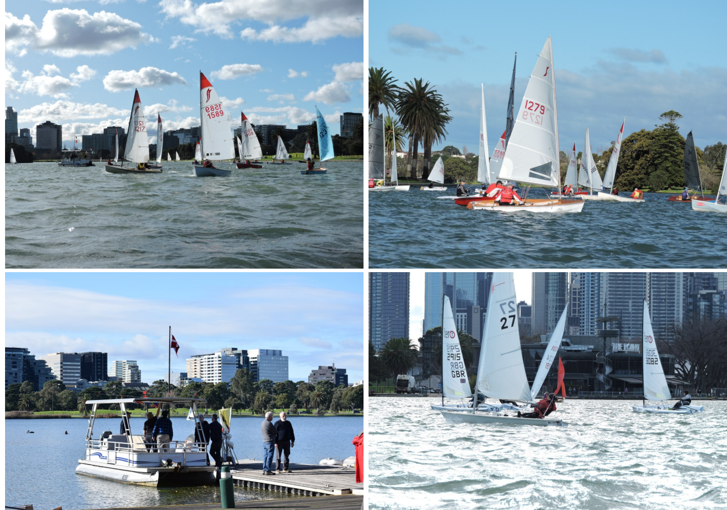
Thank you to the members and volunteers who contributed these photographs